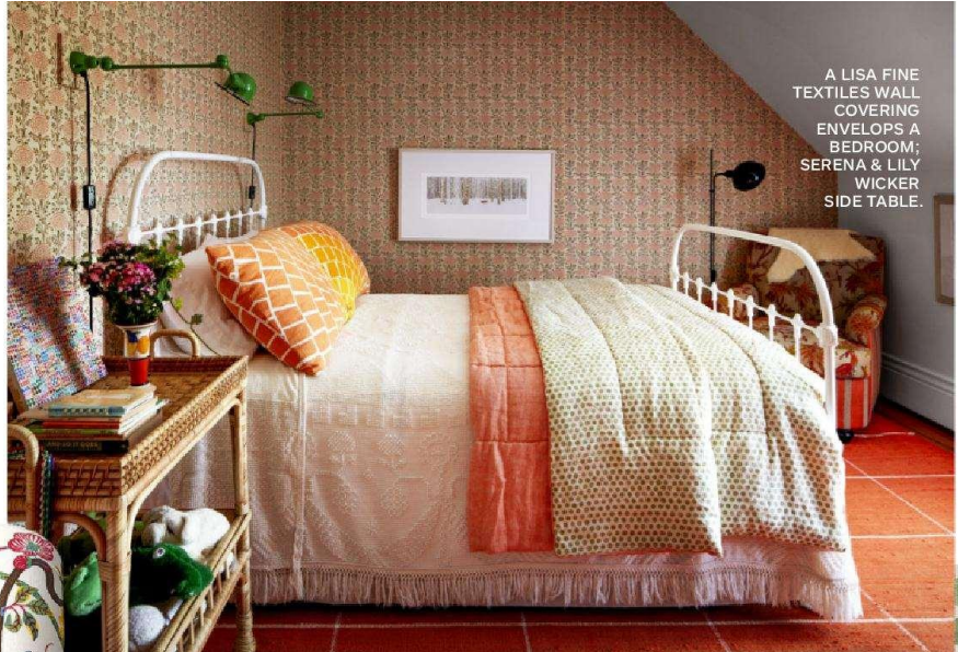
A LISA FINE TEXTILES WALL COVERING ENVELOPS A BEDROOM; SERENA & LILY WICKER SIDE TABLE.