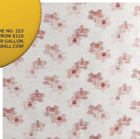
KATSURI FLOWERS FABRIC BY RP MILLER TEXTILES; TO THE TRADE. RPMILLERDESIGN.COM