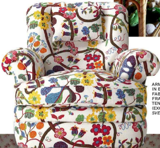
ARMCHAIR 336 IN BARANQUILLA FABRIC BY JOSEF FRANK FOR SVENSKT TENN; $4,200 (EXCLUDING FABRIC). SVENSKTTENN.SE